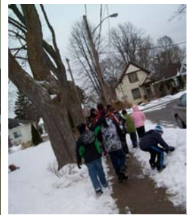
A Walk in the Village