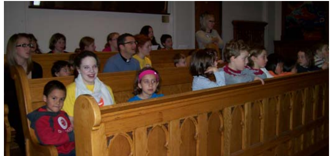
Ash Wednesday Children's Worship