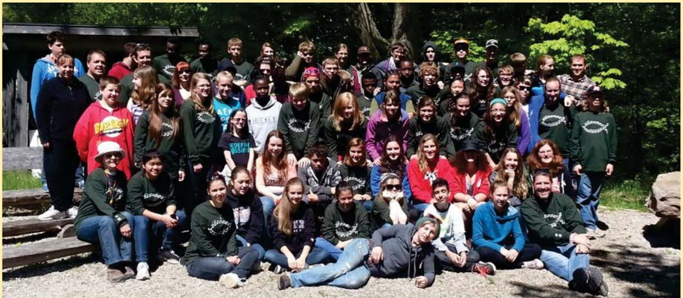
Youth Conference 2013 Participants – 60 youth and 20 leaders gathered for the weekend to pray, learn about Jesus, dance, sing, and join in fellowship.