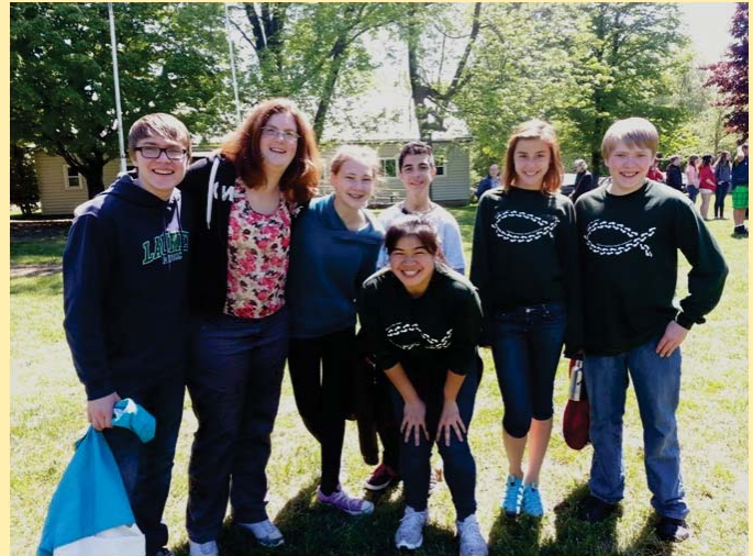
St. James Westminster Youth at Spring Youth Conference 2013

The first fall Youth Conference will be held October 18-20 th . Laura Manias will have details soon!